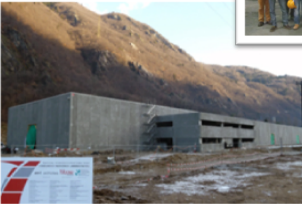
DECEMBER, 31st 2010