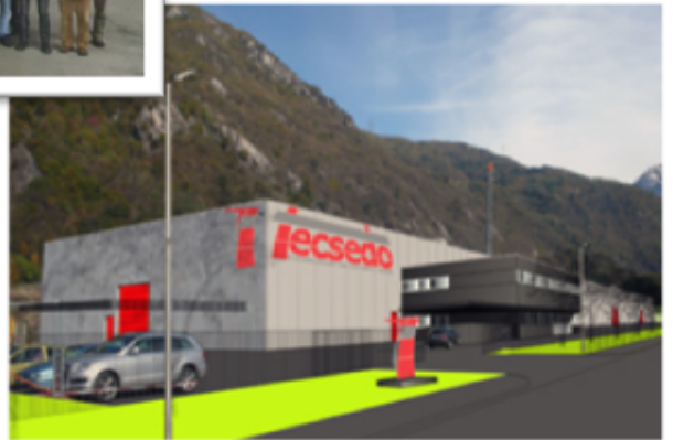
... and finally APRIL, 30th 2011!