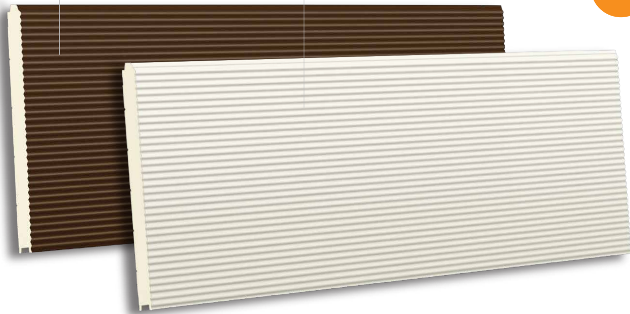
TBR/K V16 610 RAL 9010 - SMOOTH