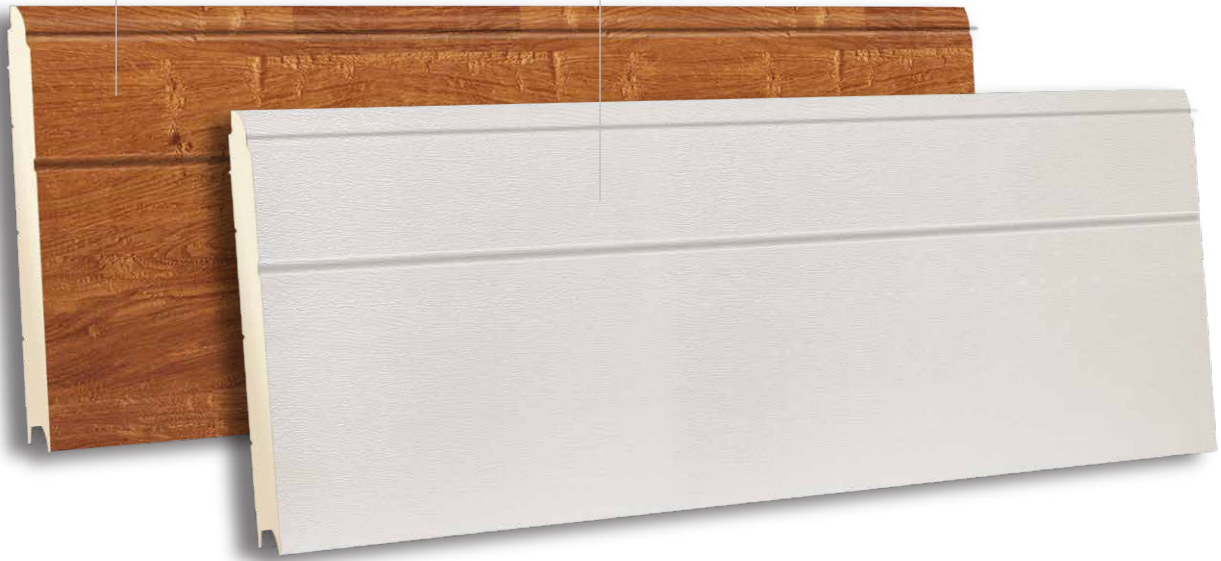
TSD 500 RAL 9010 - WOODGRAIN