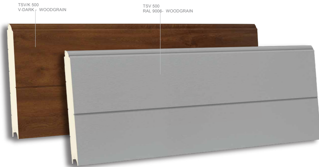
TSV/K 500 V-DARK - WOODGRAIN